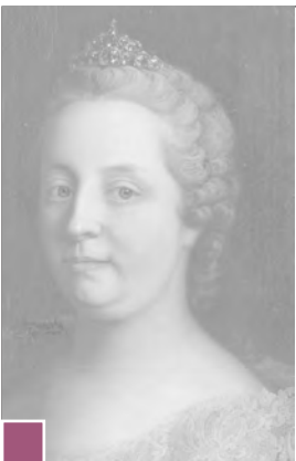
Martin van Meytens 1750-1760 Portrait of Maria Theresa (Portrét Márie Terézie) Owner: Múzeum Červený Kameň v Častej (The Červený Kameň Museum in Časta)

The Červený Kameň Museum in Častá has been a part of Slovak National Museum since 1979. Its collections are focused on the history of the Červený Kameň Castle and indoor culture of the Slovak aristocracy.