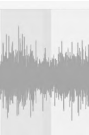
Audio segment annotation (HTML 5 prototype)