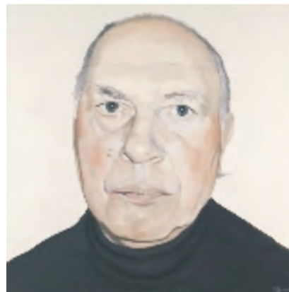
Imre Kertész, Nobel Prize winner