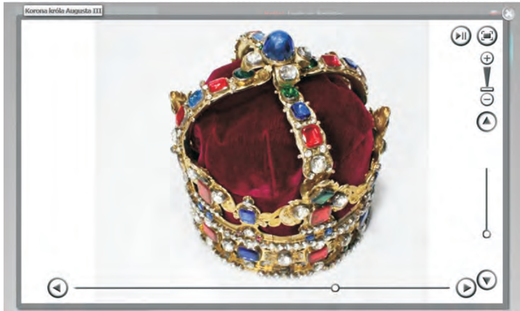
Digital image of the crown of Augustus III (King of Poland, 1696-1763)