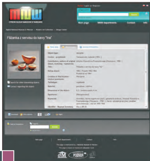
Example metadata of the exhibit from the modern art collection – a cup from the "Ina" coffee service