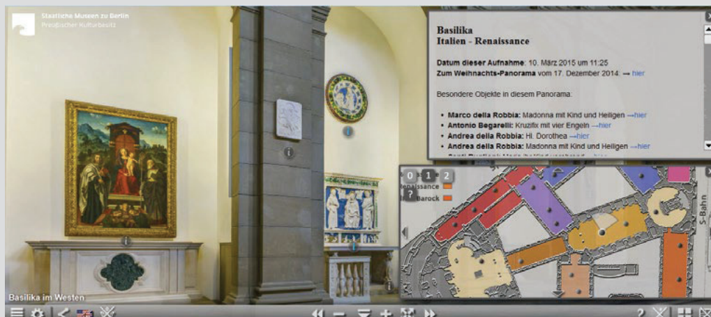
Fig. 1. Bode 360°—A panoramic view into the virtual exhibition hall “Basilika”

Another project is Bode 360°, a panoramic museum tour of the Bode-Museum, Berlin, and a best-practice example of Virtual Multimodal Museum (ViMM), a project funded under the EU Horizon 2020 programme. For the virtual panoramic tour of 63 rooms with 102 panoramas, online visitors can see either a list of rooms or a floor plan of the museum. On the tour, they can admire 850 artworks that are linked to the online database SMB-Digital of the Staatliche Museen zu Berlin (State Museums of Berlin) where online visitors can find detailed object information and further images (Gülcker et al. 2017). Bode 360° is an example of a feasible and good-quality solution for attractive panoramas and virtual tours.